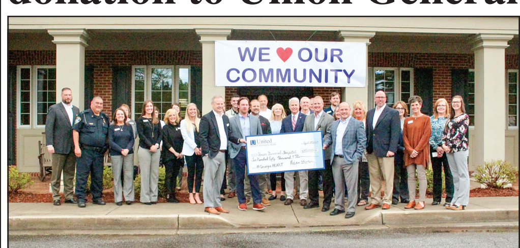
United Community Bank and Union General Health System representatives joined with other local stakeholders, including District 8 State Rep. Stan Gunter, for a $250,000 check presentation last Thursday.

By Brittany Holbrooks North Georgia News Staff Writer