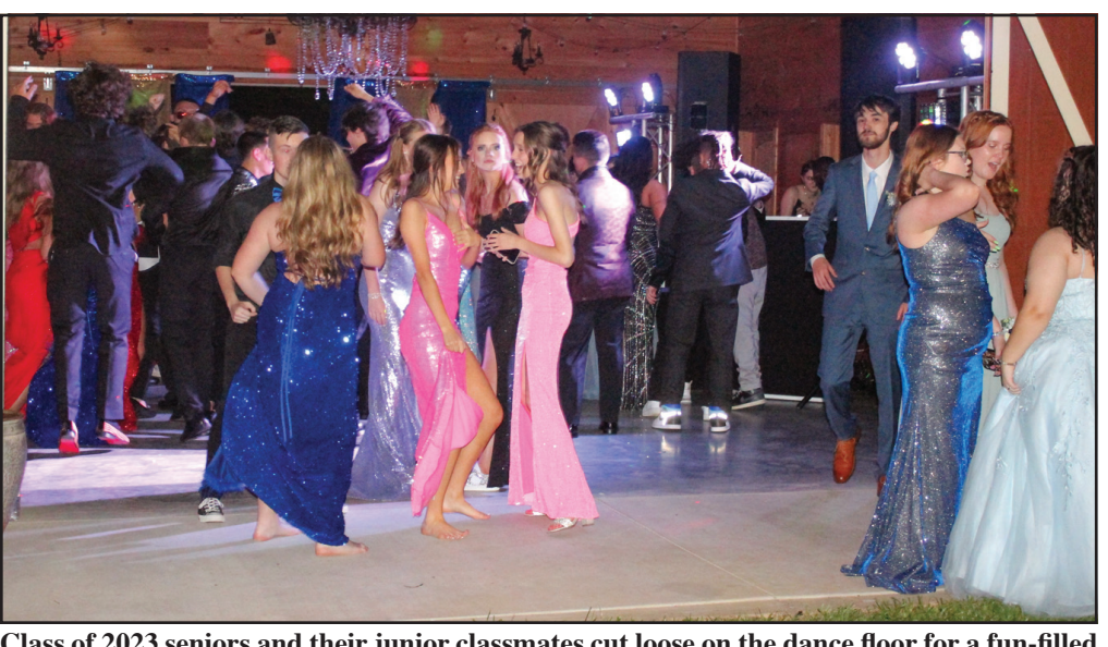
Class of 2023 seniors and their junior classmates cut loose on the dance floor for a fun-filled Saturday night that everyone will remember.

giggle. She hopes to go into early childhood education.