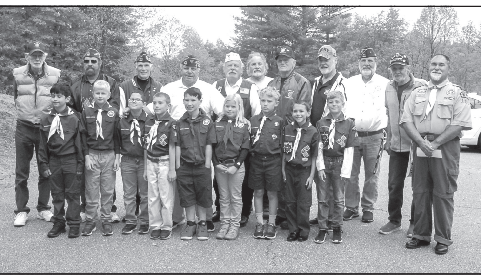
Towns and Union County veterans recently came together with America's future - community youth from the Cub Scouts – to continue a time-tested tradition of properly retiring worn-out

watching rambunctious Cubs run across the room. "That would be good."